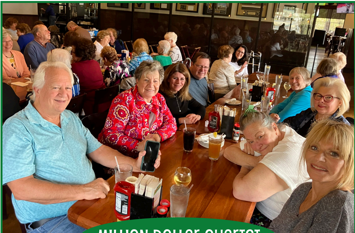
MILLION DOLLAR QUARTET