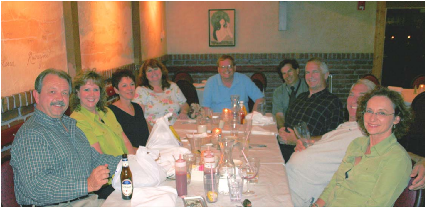
Happy people gathered at the restaurant of the month, Mario's Italian, Thursday, September 20.