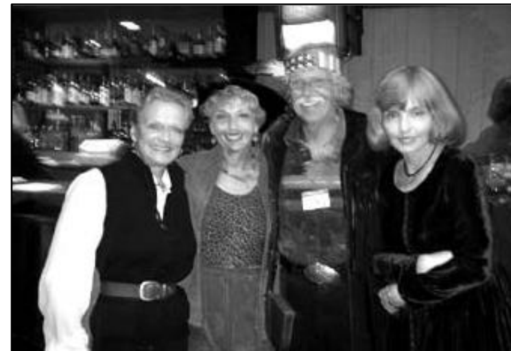
Fun at the last meeting