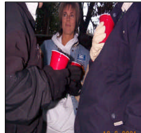
...and beer drinking