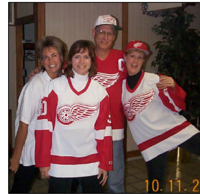
Pictures from the October 11 Meeting. Try to visualize them with the startlingly vivid reds. Better yet, see these photos in their natural hues at our web site, www.gmskiclub.org . (Not pictured—everyone who forgot to wear red and white.)