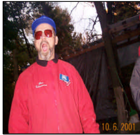
Olympics meant screaming...