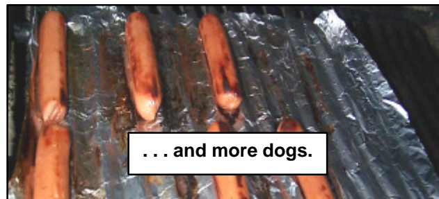
... and more dogs.