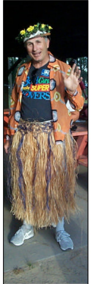
Halmich Park General Meeting