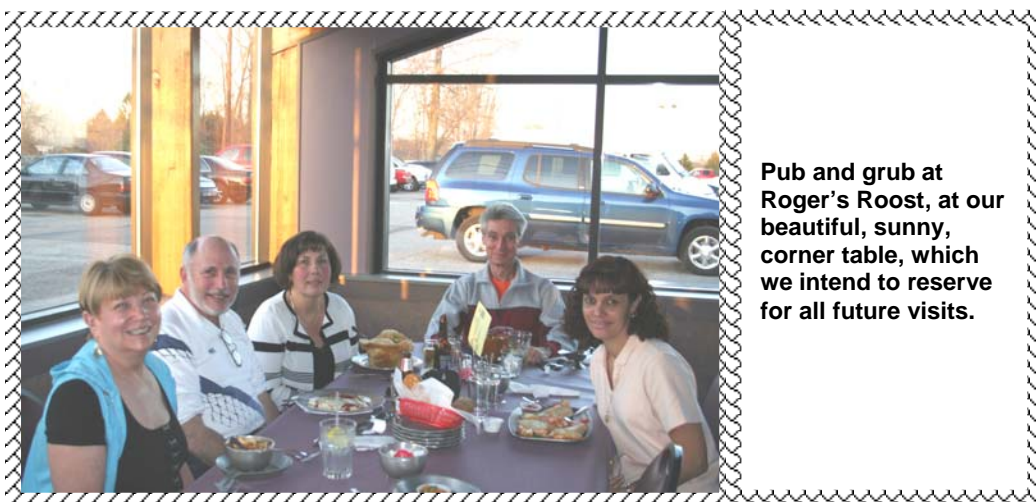
Pub and grub at Roger's Roost, at our beautiful, sunny, corner table, which we intend to reserve for all future visits.

Reserve your berth by contacting Michael Bourke, excelsiormb@hotmail.com , 586-776-7685.