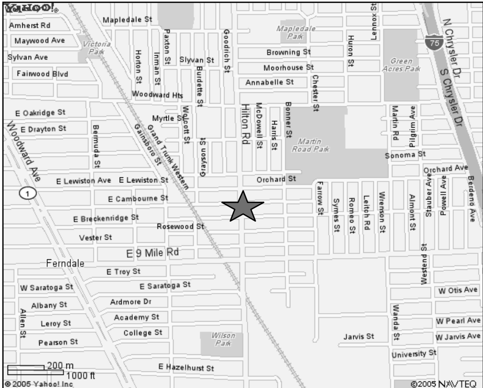
Map to Warrilow's Restaurant, 2140 Hilton, Ferndale, Mi. 48220