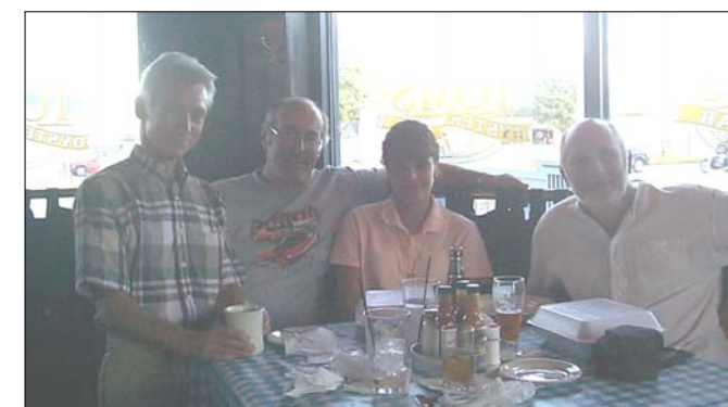
Tom's Oyster Bar, July 20 Restaurant of the Month A small turnout, but a fine meal, nonetheless.