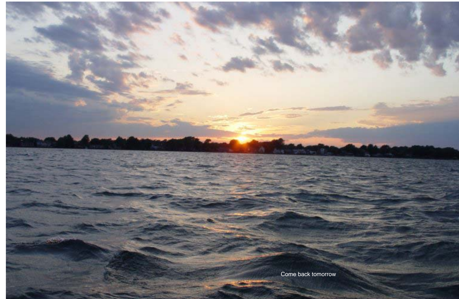
Come back tomorrow

$4.00 Admission for our members and $6.00 for Guests Get in free by bringing your favorite dessert.