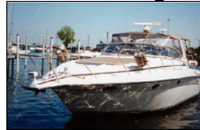
Year 1999 Model 402 Commodore

The Sport Cruiser is clean. Has had only one owner. Must see to appreciate.