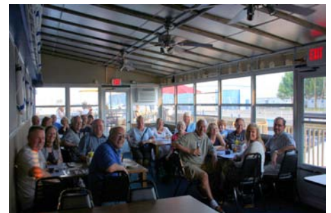
Pub & Grub at Mikes on the Water