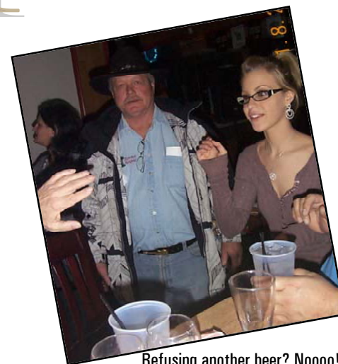
Refusing another beer? Noooo!