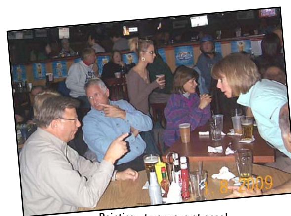
Pointing...two ways at once!